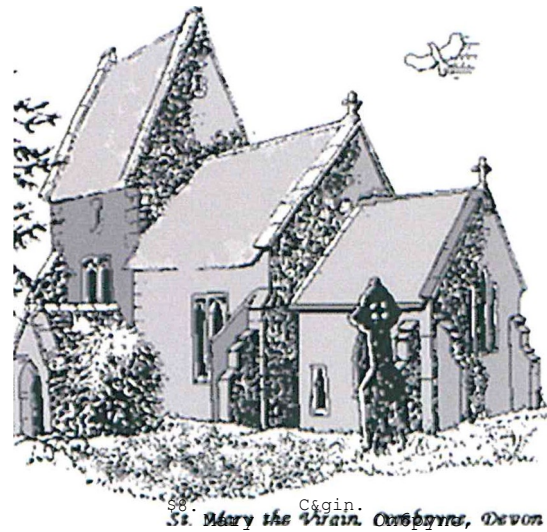
St. Mary the Virgin, Combyrne, Devon

The Church is a 13 th Century (possibly Saxon foundation) Grade I Listed Building. Notable historic features include the unusual saddle back roof to the tower, two bells which are among the oldest in the Diocese and wall paintings — on which extensive conservation work was completed a few years ago, followed by re-decoration of the interior.